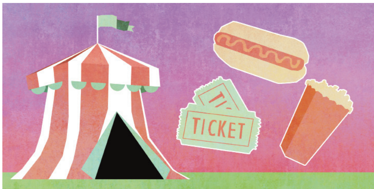
Illustration by Tamara Turner/Staff Artist

The biggest event of the year School Daze returns Sept. 19 and 20 from 10 a.m. to 2 p.m. Students can take a break from their classes and meet with local businesses, clubs and departments.