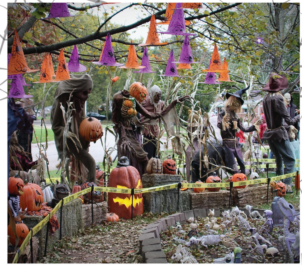
The Chamber's home is located at 8510 Alper in Westland.